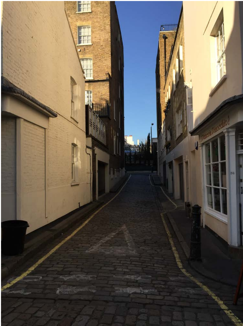
Groom Place (Pizzeria on Right) Looking North