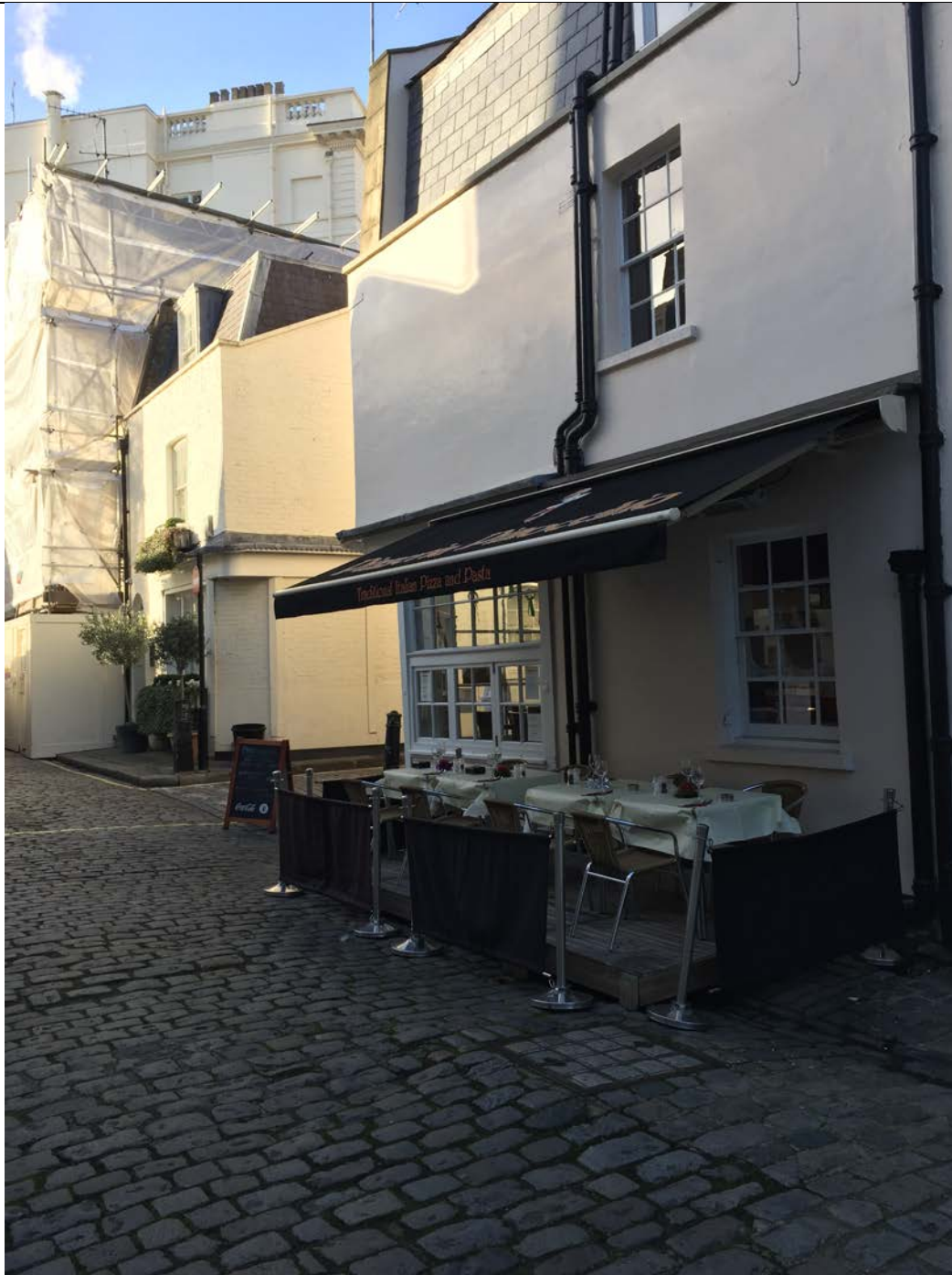
38 Groom Place