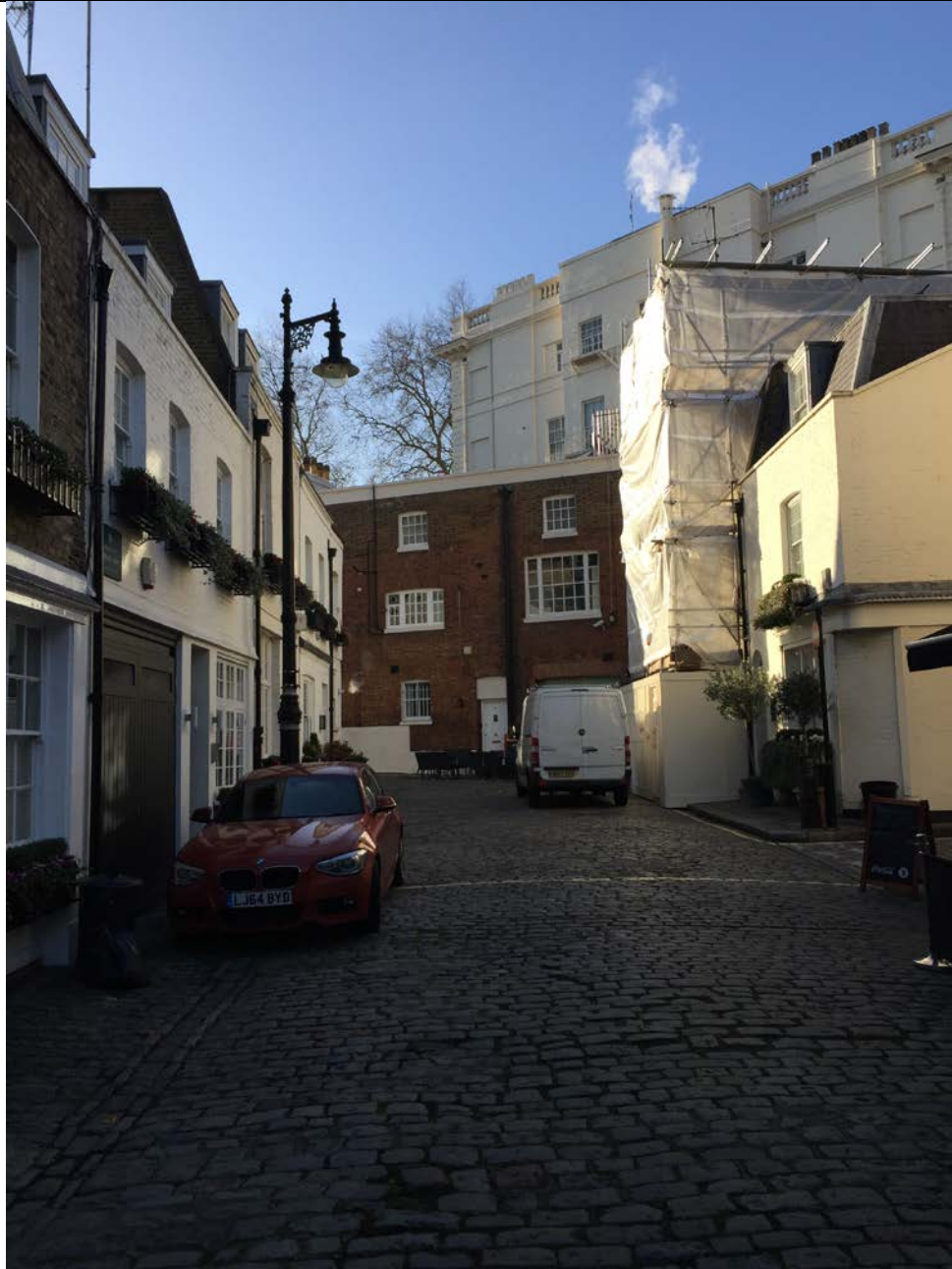
Groom Place (Pizzeria on Right) Looking Southwest